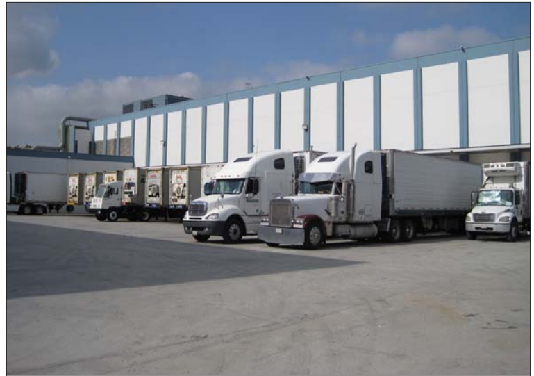
By working with SCE on energy efficiency measures and demand response program participation, Buena Park Cold Storage said it currently saves approximately $200,000 annually on its electricity bill at its frozen foods warehouse.

He added, "Though it required substantial capital to undertake the energy efficiency projects, the rebates we have received from SCE and our savings on our monthly utility bill made these projects a 'no brainer.'"