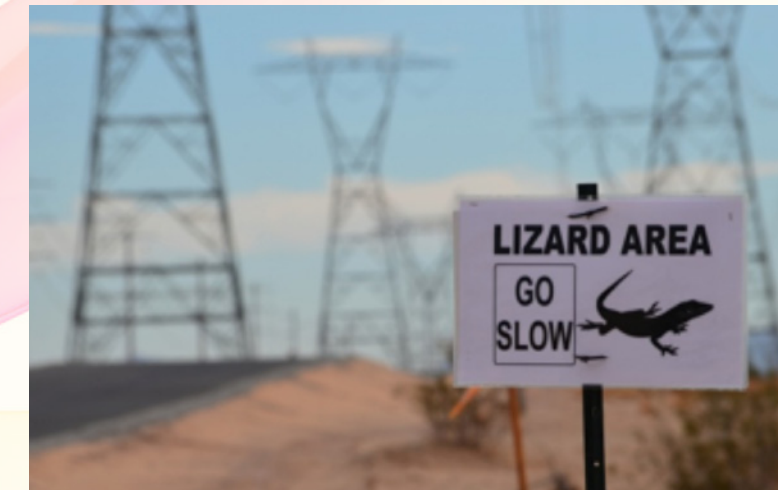
A sign along an access road reminding crews to be watchful of sensitive biological resources.

SCE is committed to environmental protection and is working closely with federal, state and local partners to mitigate potential environmental impacts from the project. SCE is implementing conservation and design features to avoid or minimize disturbance to sensitive biological resources such as the Stephen's kangaroo rat, Coachella Valley milk-vetch, Coachella Valley fringe-toed lizard, flat-tailed horned lizard, and desert tortoise. To protect cultural resource sites, SCE is using extensive inventory, monitoring, site evaluation, and awareness programs as well as consulting with Native American tribes and developing long-term plans to protect cultural sites from direct impacts of project operation and