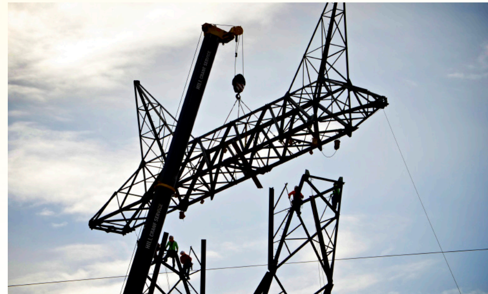
Construction crews working on erecting a 500kV tower