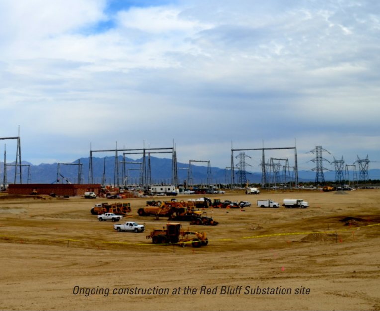
Ongoing construction at the Red Bluff Substation site

NO POSTAGE NECESSARY IF MAILED IN THE UNITED STATES