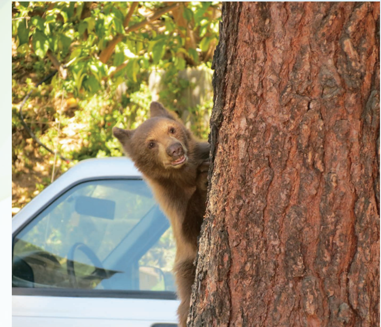
TRTP construction crews regularly encounter a variety of wildlife, such as this black bear cub which was spotted in Duarte last September. Construction crews receive training on how to work safely knowing wildlife are in the areas we are building.

If you have any questions about the scheduled work or other project-related activities in your neighborhood, please contact us at the project hotline at (877) 795-8787 or visit the TRTP website at www.sce.com/trtp .