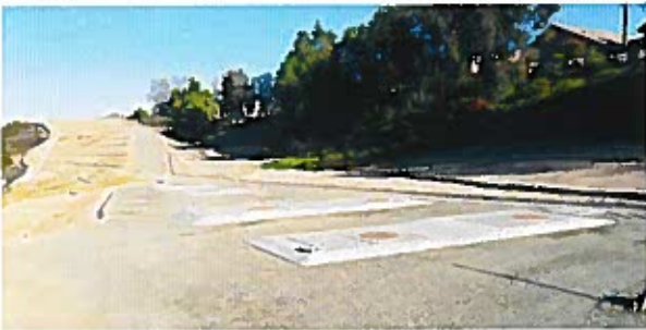
500 kV underground vault pad.