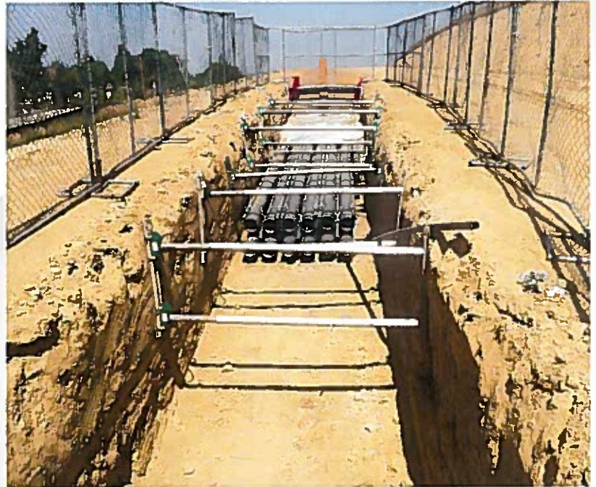
500 kV underground duct bank.

The Tehachapi Project is a series of new and upgraded transmission facilities, spanning approximately 173 miles, to deliver electricity from renewable wind energy generators as well as power added to the system from traditional generating sources, in Kern County south through Los Angeles County and east to the existing Mira Loma Substation in Ontario, San Bernardino County.