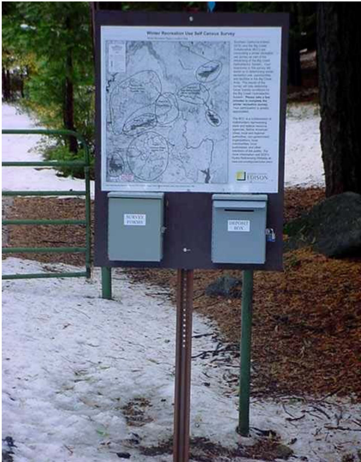
Figure REC-21-2. Winter Recreation Survey Self-Census Kiosk